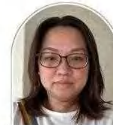
WYNN Vice -Chairperson