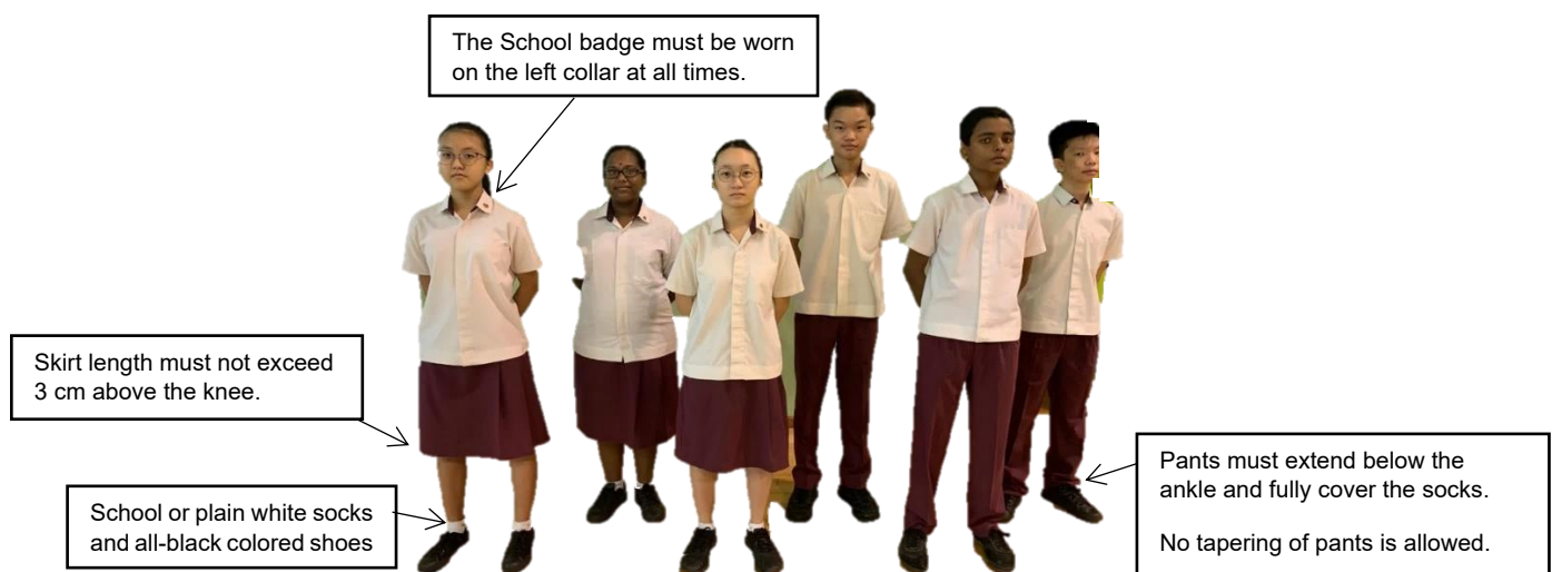
Figure 1: Full School Uniform