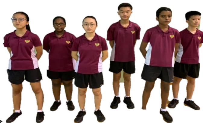
Figure 3: School P.E Attire

Students are only permitted to wear the official school PE shorts; all other types of shorts are not allowed. Please note the following for wearing the PE attire: