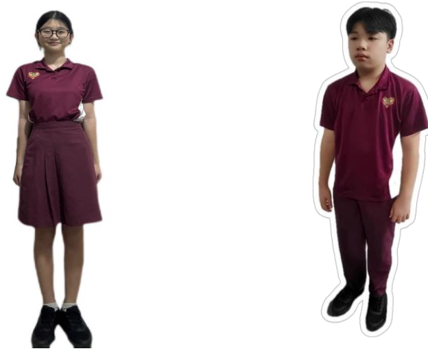
Figure 2: Half School Uniform

Girls must wear their school PE T-shirt tucked in at all times for a neat and modest appearance. Boys will wear their school PE T-shirt untucked, as permitted by the school's uniform design.