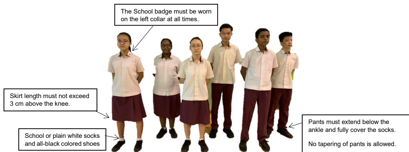
Figure 1: Full School Uniform