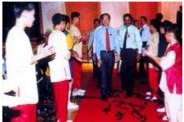
At the official opening of the school by Mr Yeo Cheow Tong.

For a holistic student-centric, values-driven education, the school has developed and implemented two distinctive programmes in 2015 aligned to the School Motto. These distinctive programmes aim to develop our students into Confident Persons, Self-Directed Learners, Concerned Citizens and Active Contributors as spelt out in the student outcomes of the MOE 21st Century Competencies Framework.