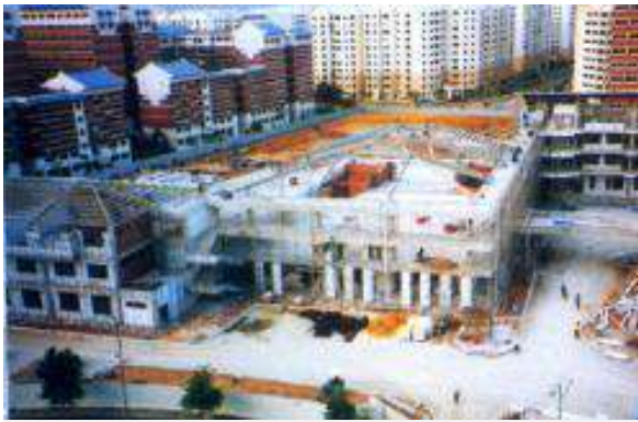
The building of the school before 2000.